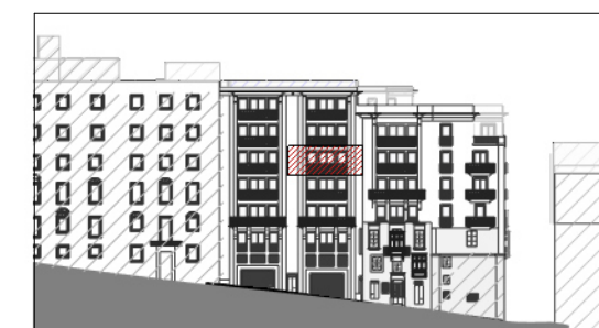
St. Ursula street façade