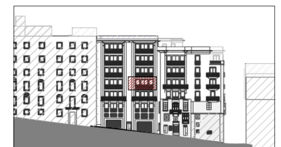
St. Ursula street façade